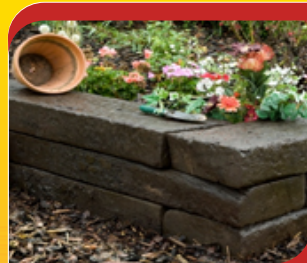
For the Garden